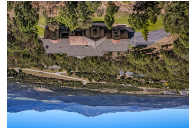
48 CRESCENT LANE $1,552,500 | May | Buyer 4 beds | 3.5 baths | 3,764 sq. ft.