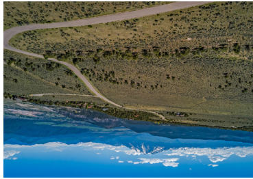
38 ASTER DR (LOT) $250,000 | May | Seller 3.2 acres