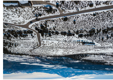
42 GOSSAMER RD (LOT) $329,000 | June | Seller 2.43 acres